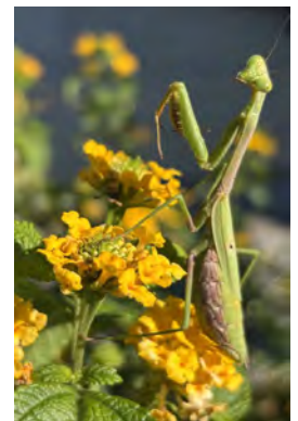
Mantis preying on Lantana