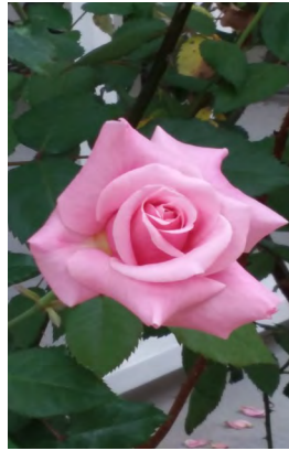
Belinda's Dream - Rosa