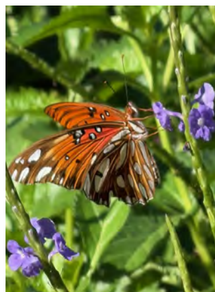
Gulf fritillary on porterweed - Stachytarpheta frantzii