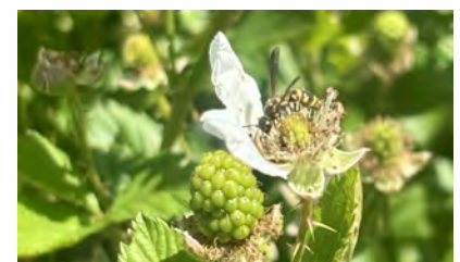
Blackberry - Rubus Allegheniensis