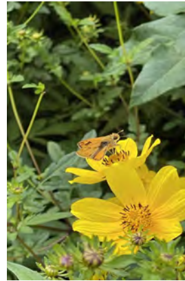
Beggar's tick - Bidens aristosa