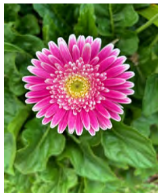
Gerbera - Gerbera Jamesonii