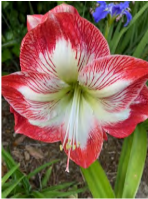
Amaryllis - Hippeastrum