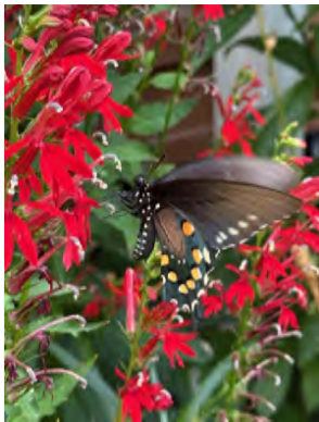
Pipeline swallowtail on cardinal flower - Lobelia cardinalis