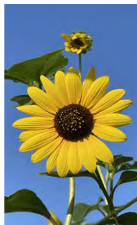
Sunflower - Helianthus annuus