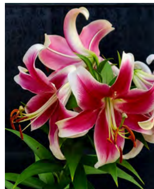
Lily - Lilium