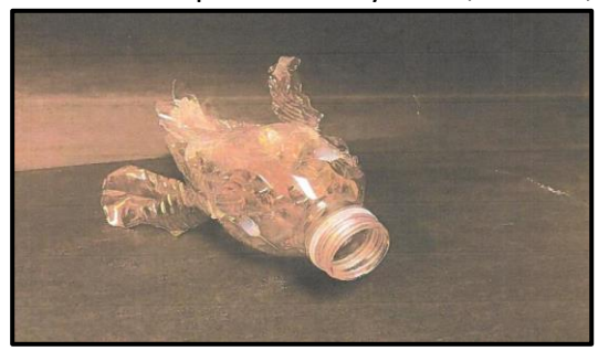
A national winner from last year

Students in grades 4 - 8 are eligible to create a sculpture of recyclable, reused,